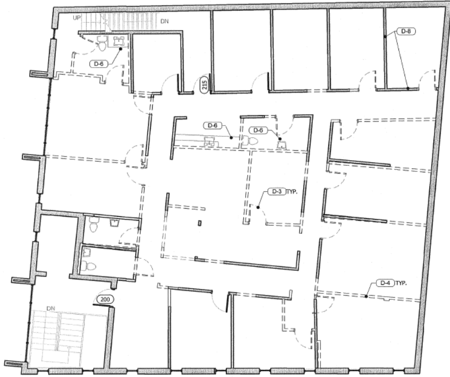
2 2nd FLOOR PLAN 1/8" = 1'-0"

PLEASE NOTE : ALL DASHED LINES ARE EXISTING WALLS